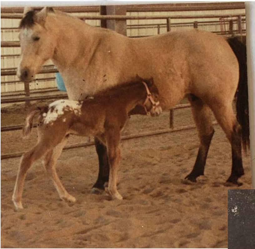
Rose with her dam, 1985