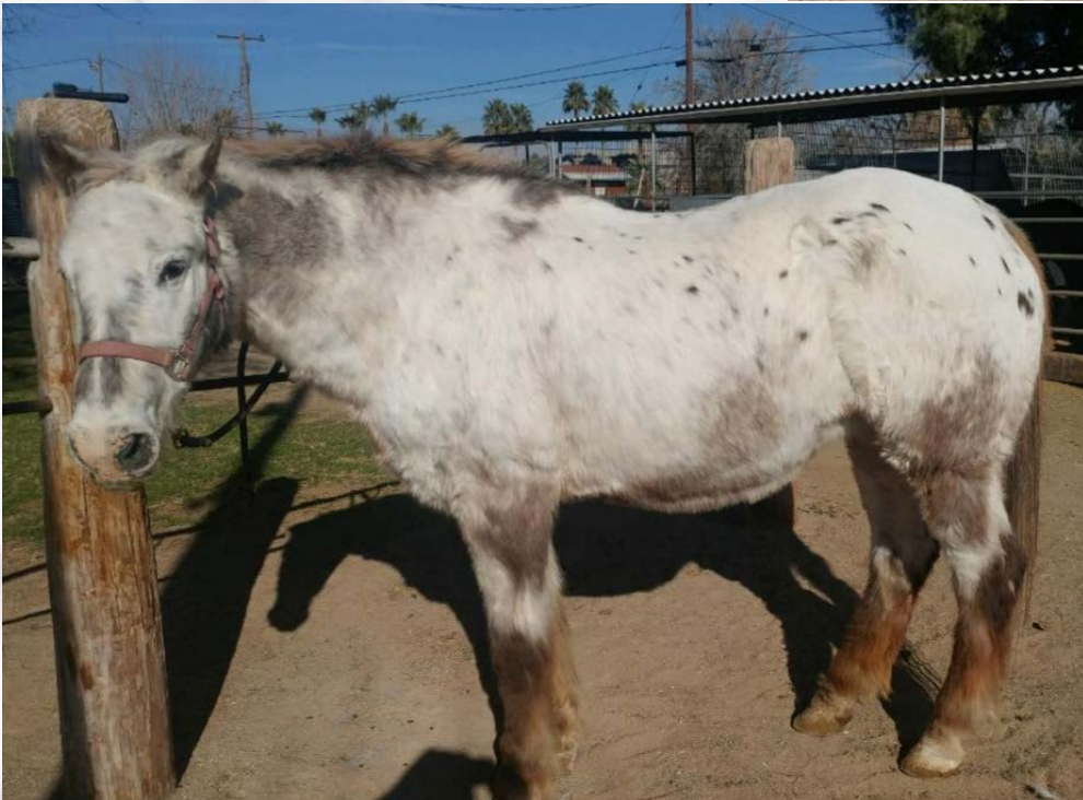
Rose now, winter of 2020