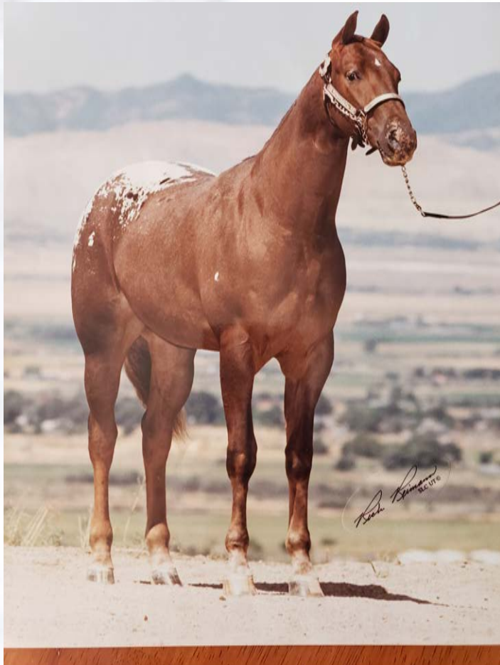
Rose as a two-year-old