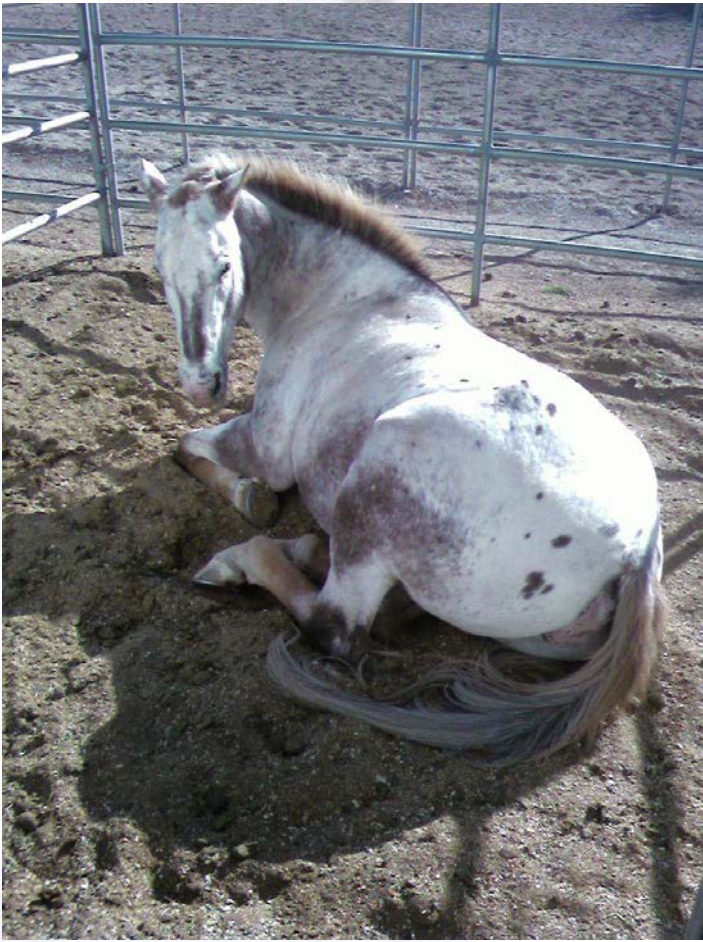
Rose at 26