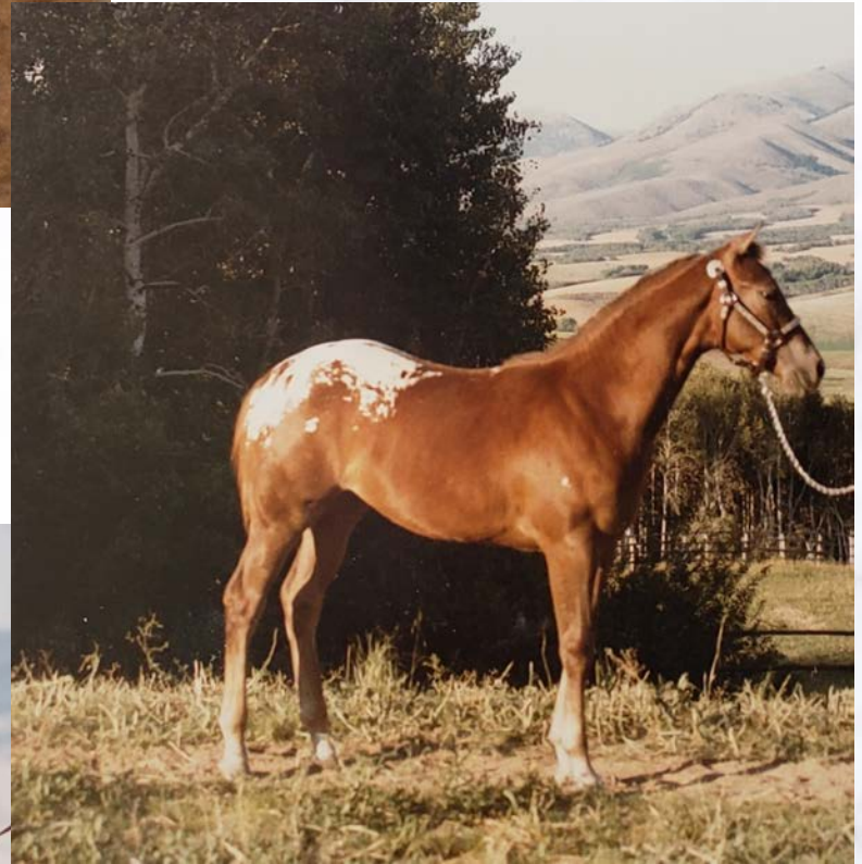
Rose as a weanling