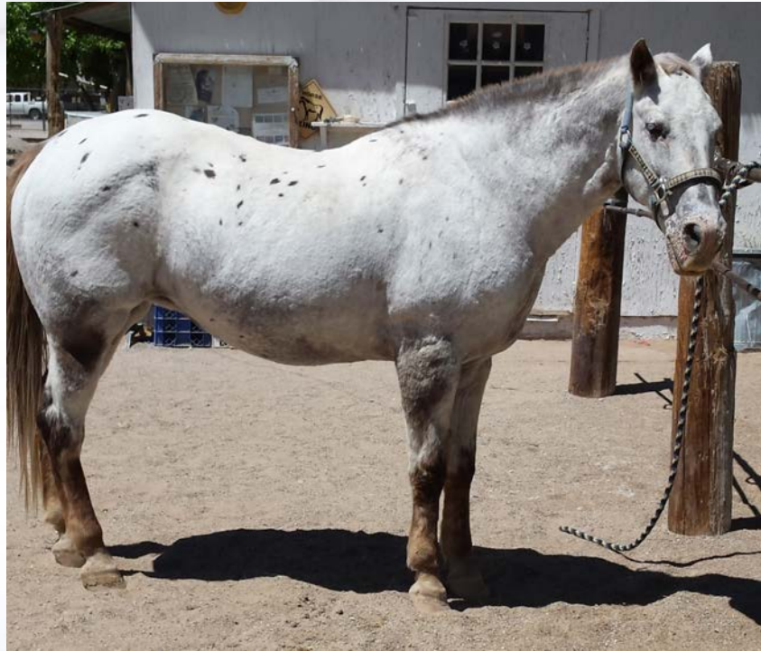
Rose summer of 2017